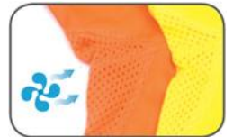
Under-Arm Cool-Breeze Air flow vents