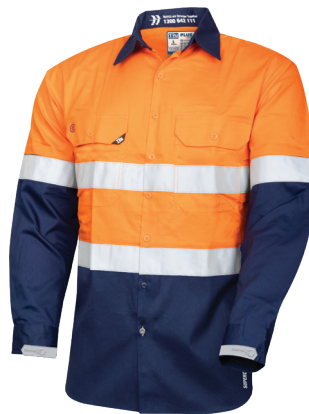
Integrated Graphex® Cut Resistant Sleeve